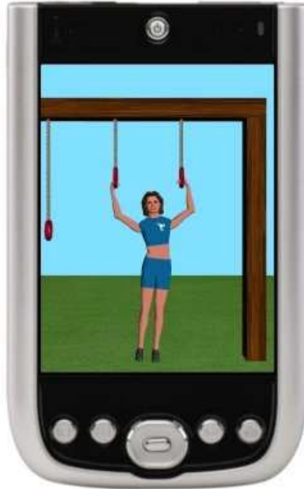
Fig. 1. The embodied agent is demonstrating a typical exercise with rings on a fitness trail.

As an alternative to the embodied agent, one could display videos of a real trainer performing the exercises on the mobile device, but using 3D animations has two main advantages over pre-recorded videos: (i) 3D animations can be interactively explored by the user, who can easily watch the exercise from the desired positions to clarify her doubts, and (ii) animations require much less space than videos on the mobile device.