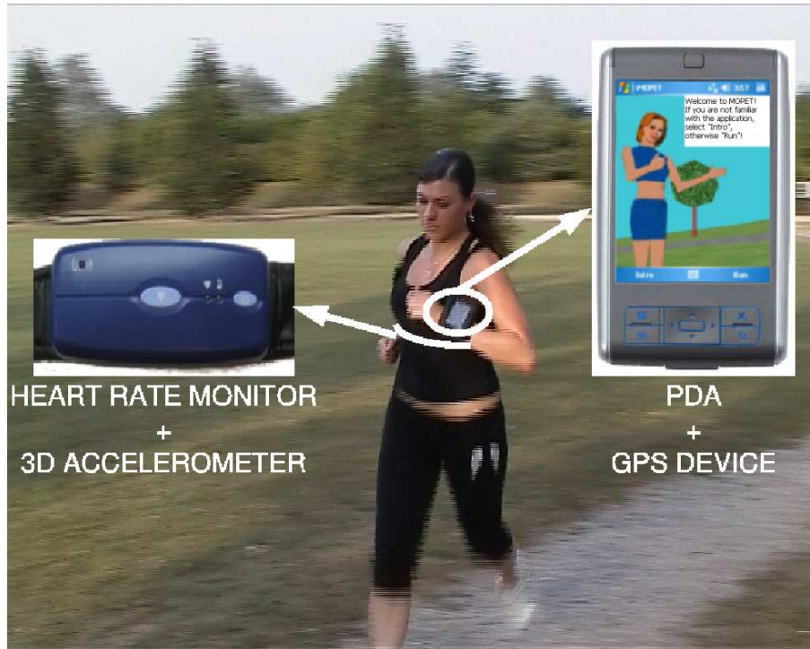
Fig. 4. Wearing MOPET during outdoor activities.

The high-level architecture of MOPET is illustrated in Figure 5 and is organized into three main subsystems: