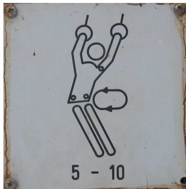
Fig. 3. Graphic plate of a fitness trail exercise.

In fitness trails, exercises are usually explained by graphic plates in the stations (see Figure 3 for an example). These plates are often difficult to understand and exercises could thus be performed improperly, wasting the benefits of the physical activity and also risking injuries.