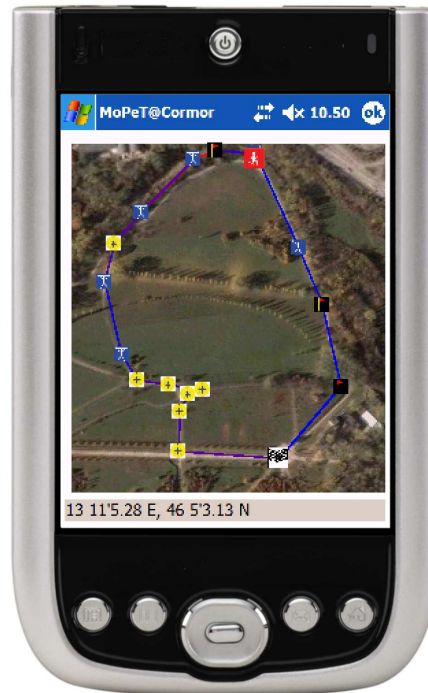
Fig. 2. Map with the left half of the trail completed.

the user her speed (a red triangular flag). Moreover, the trail is marked with a polygonal line which is initially blue. MOPET provides common navigational cues, such as changing the user's position in the map based on GPS data and changing the color of the polygonal lines to indicate the completed parts of the trail. Figure 2 shows the map after the user has completed the left half of the trail. However, this graphical feedback can be conveniently examined only by a user who is not running, so we provide the user also with audio information: when she approaches a fork, MOPET gives her vocal directions using the internal speaker of the PDA or a Bluetooth earphone.